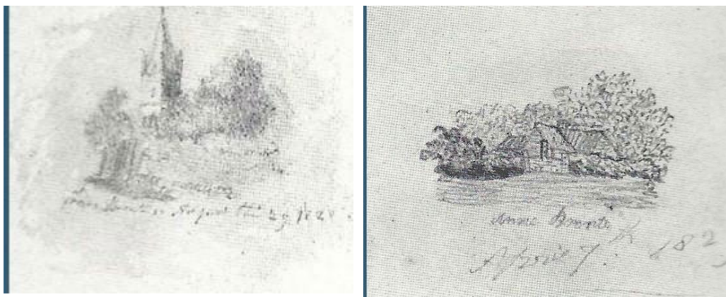
Figures 2 and 3: Anne Brontë, pencil drawing of a church surrounded by trees, 1828 (left). Anne Brontë, pencil drawing of a cottage with trees, 1829 (right). Brontë Parsonage Museum.