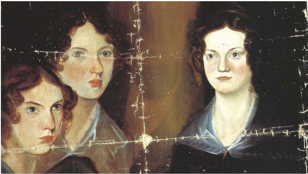
Figure 1. Detail from The Brontë Sisters, oil painting by Branwell Brontë, c. 1834. The National Portrait Gallery.

Scrutinising her juvenile poetry and drawings suggests that the strength and energetic cultural critique of her mature writing was already implicit, if not explicit, in her juvenilia. This discussion will suggest characteristics of Anne’s worldview, artistic renderings, and writings evident in her juvenile productions and in her novels as well. In studying the juvenilia, we will catch sight of young Anne Brontë becoming the novelist Acton Bell.