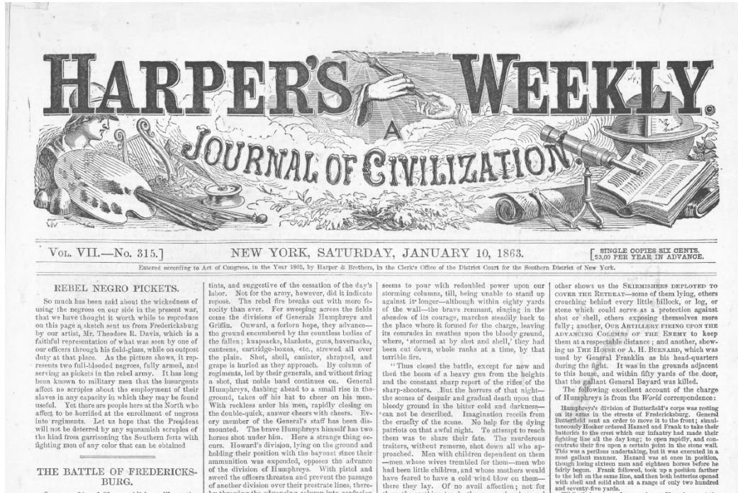
Fig. 3. Harper's Weekly, 10 January 1863, p.1.

Like other newspapers of its day, the Penfield Extra's front page featured standard newspaper fare, including weather reports, notices of marriages and deaths, poems and fiction, and news from both Civil War battlegrounds and the local main street. At the back, two pages of advertisements, with bold, varied typeface and catchy images, hawked the wares of merchants from Upstate New York (fig. 4). At the same time, however, the masthead—oriented around a tiny visual Bible subtitled “Our Hope”—announces that The Penfield Extra is “Little Nellie’s Little Paper” (fig. 2). When read together, then, the distinctive masthead and professional layout of the weekly paper both highlight and obscure the fact that the designer, author, and printer is a self-described “little Lass not yet in her teens who is the sole Editress, and Compositor, and probably the youngest Publisher ... in the world” (Publisher’s Box, 28 June 1862, p. 4).