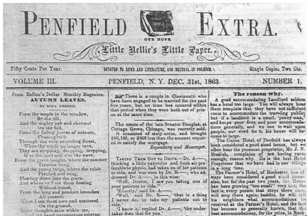
Fig. 2. Penfield Extra, 31 December 1863, p. 1, Central Library of Rochester and Monroe County, Historic Newspaper Collection.

EVEN A quick glance at an issue of the Penfield Extra tells us that we are viewing something both conventional and unconventional. Produced weekly throughout the Civil War, from 1861 until 1866, the Penfield Extra in some ways resembled other mainstream newspapers, but in other ways there was nothing like it. Even as the Extra resembled the sophisticated, nationally circulated Harper's Weekly in layout and size, its masthead announced its innovative approach ("Devoted to News and Literature and Neutral on Politics") and highlighted its distinctive ownership ("Little Nellie's Little Paper") (figs. 2 and 3).