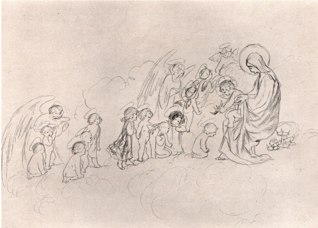
Fig. 2. Daphne Allen, "Christ Crowning the Holy Innocents," from A Child's Visions , p. 23.

and her recognition—also signalled in her paintings and drawings, which I will explore below—of a desiring child, a child who is interested in profit (for Bianco can use the sale of her work to, quite literally, feed herself) and consumption (the ways viewers consume both art and artist).