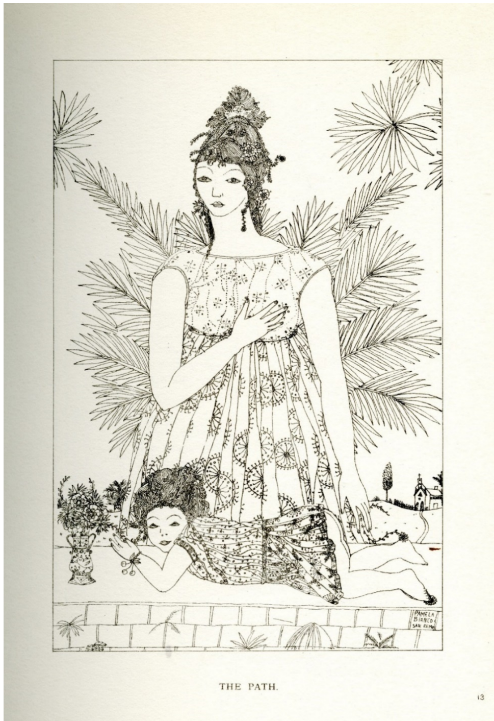
Fig. 6. Pamela Bianco, "The Path," from Flora , p. 13.

artists such as Aubrey Beardsley, and the tension between sacred and profane extends to its subject. The dominant female figure resembles an angel or protective guide; the fronds splayed behind her back form wings, and her hand is pressed to her breast in