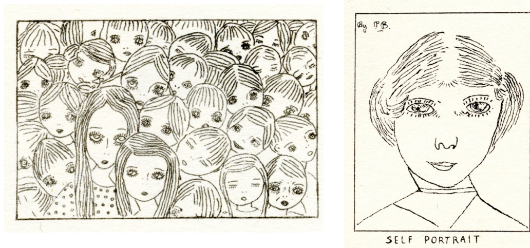
Figs. 3 and 4. Pamela Bianco, “Bitter Waters,” from Flora , p. 19, and self-portrait, from Flora , p. 43.

Bianco’s art often exhibits a parallel sense of overproduction: some of her drawings and paintings cram the frame with flower-bedecked, naked cherubs, displaying a surfeit of Romantic children. However, Bianco gestures towards this common visual trope only to manipulate it. Many of her child figures meet gaze for gaze, aware of the adults looking at them. The heavy lashes of her children (including herself, in a self-portrait) frame eyes that communicate a self-consciousness about being looked at, perhaps even consumed (figs. 3 and 4). That self-consciousness